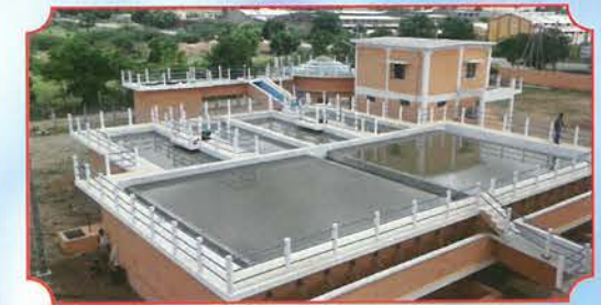
Challakere - 22.10 MLD WTP