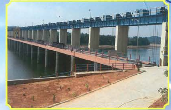
Mangalore vented Dam