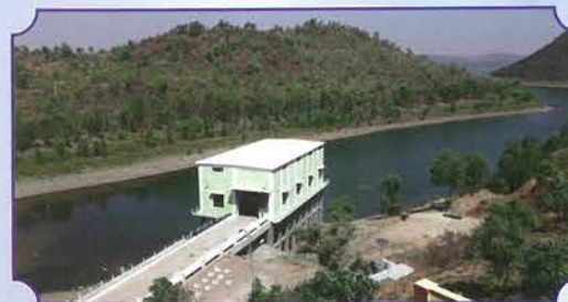
Hiriyur - Challakere : Head works