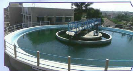
Hukkeri - Clarifluculator