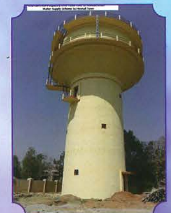
Honnali - OHT