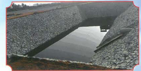
Birur UGD - STP