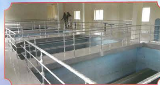
Bantwala - WTP Filter house